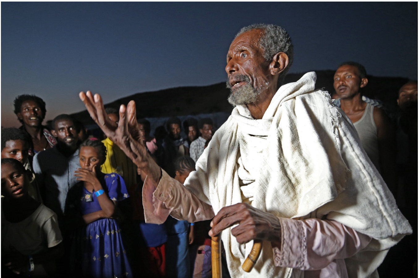
Photo: Ethiopian refugees who fled fighting in Tigray province at the Um Rakuba camp in Sudan's eastern Gedaref province.