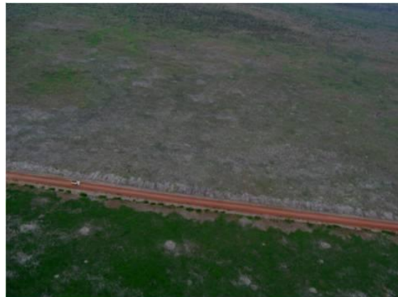
Impact of roads on drainage, GNPOC concession, 2004

For social impacts a form of remedy should also be indicated. Firstly, because affected people are entitled to it. Secondly, by acknowledging the social impact and remedying it, grievances towards the petroleum industry are likely to diminish. This can stimulate the building of the social support base for the industry. There are basically two options to address the issue of remedying social impacts: