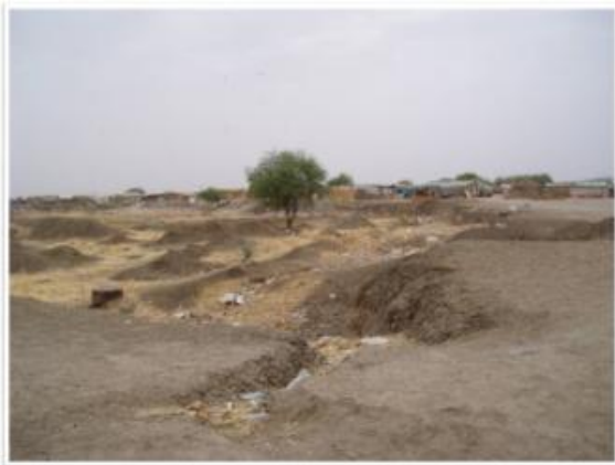
Excavated village in Concession Block 3/7, Upper Nile State, 2005