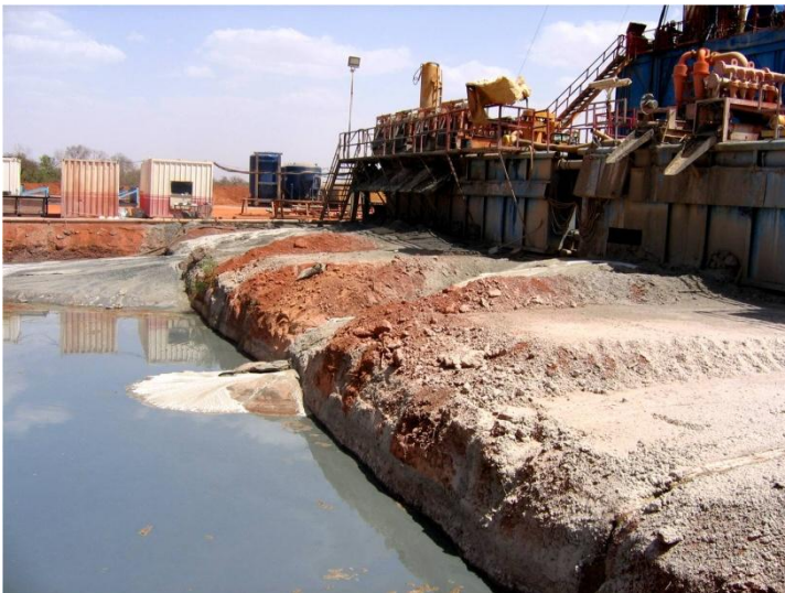
Drilling chemicals and mud

At this moment of time, it is too early to estimate the costs of these last two phases.