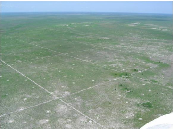
Seismic done in 1980's still visible