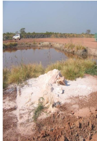
Unlined drilling pit