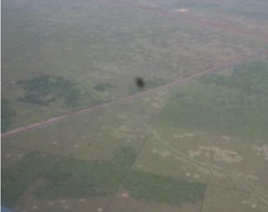
Impact of seismic, 8 years after activities in Unity State