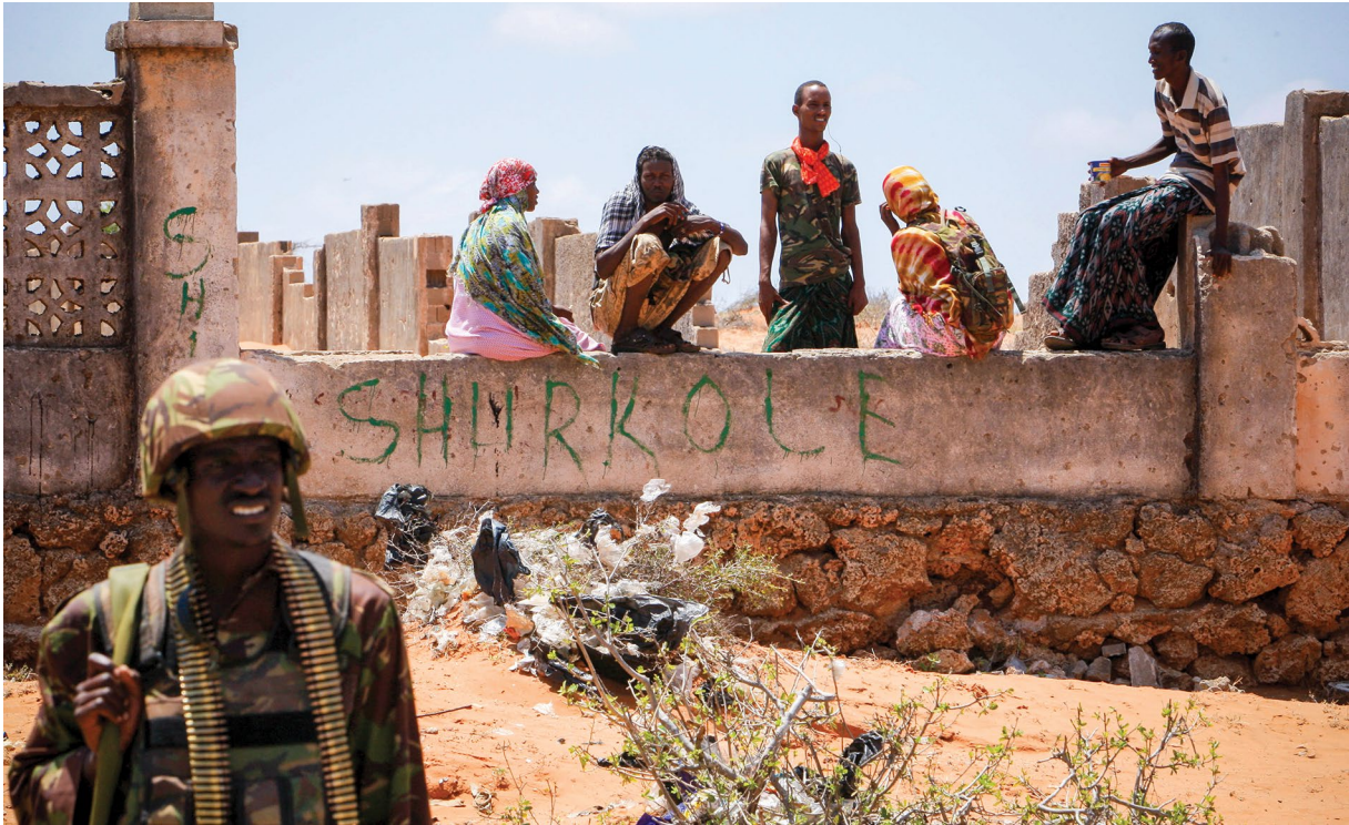
Somali women and soldiers of the Somali National Army sit along a wall while a Kenyan troop (left) serving with AMISOM, the African Union mission, looks on, in Kismayo, southern Somalia.

guards on the ships they previously robbed? In short, would the most likely legal employment for most militiamen be as private security guards? And would that constitute the kind of fundamental change that Somalia needs in order to move towards stability?