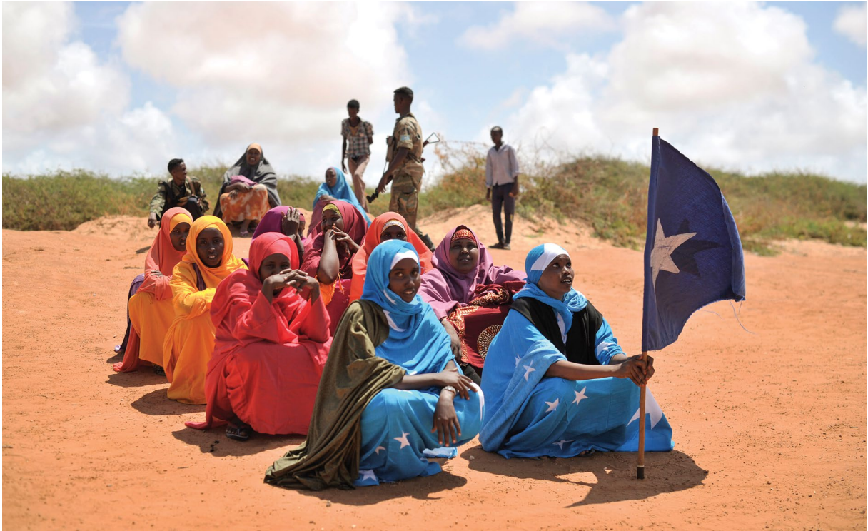
A young woman holds the Somali flag during a demonstration by a local militia, formed to provide security in Marka, Somalia.

Somalia's current organization into federal member states dates only to 2015 when a formal decentralization process supported by the international community began, though some regions — notably Puntland and Somaliland — declared autonomy much earlier. The process of state creation has been tense, with interstate and state-federal rivalries over territories, control of armed forces, resource-sharing and power-delegation. One of the key areas of dispute concerns the distribution of armed forces. Somalia's 2017 national security architecture — agreed between the Somali Government, federal member states and the international community — authorizes the SNA to have just 18,000 soldiers, well below its current level of about 23,000-27,000. In addition, it envisions that the national Somali police (the SPF) be capped at 30,000 members. This design assumes that some existing militias — specifically, the state-level darwish , which are not currently recognized