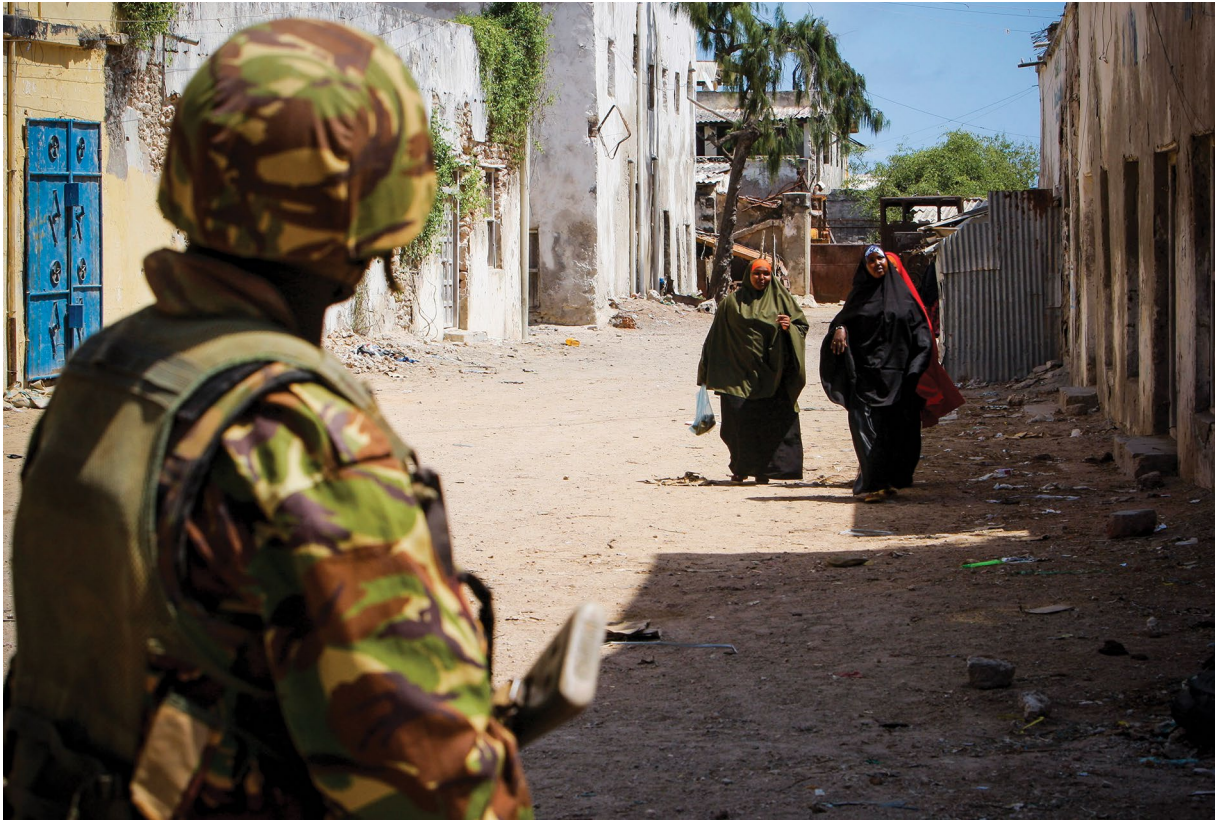
A Kenyan soldier with the African Union Mission in Somalia (AMISOM) keeps watch on a street in the city centre of Kismayo, southern Somalia.